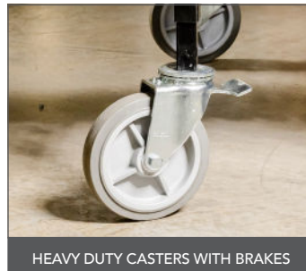
HEAVY DUTY CASTERS WITH BRAKES