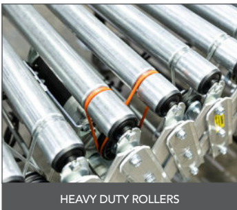
HEAVY DUTY ROLLERS

Technical Support Installation & Setup Service Maintenance Application Support Hardware Support