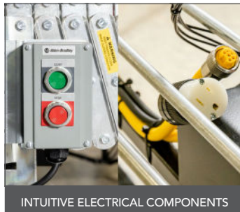
INTUITIVE ELECTRICAL COMPONENTS