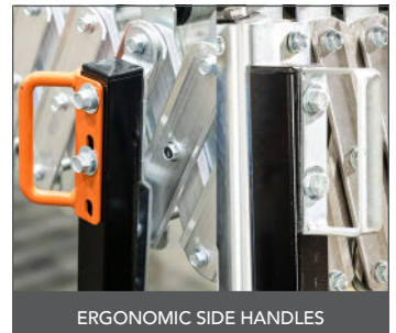
ERGONOMIC SIDE HANDLES

VISIT OUR WEBSITE TO LEARN MORE :: WWW.FMHCONVEYORS.COM