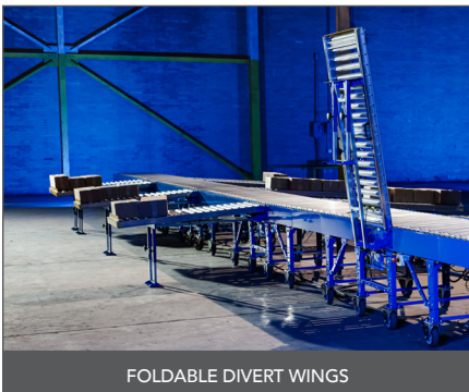
FOLDABLE DIVERT WINGS