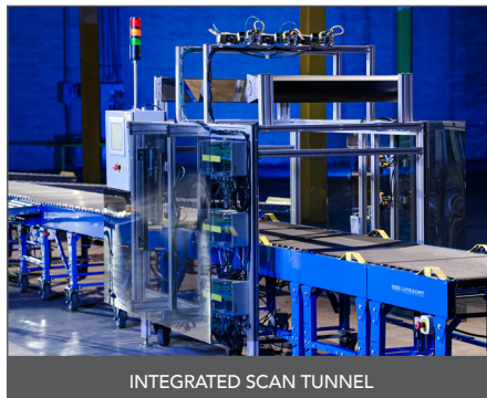
INTEGRATED SCAN TUNNEL