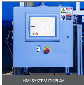
HMI SYSTEM DISPLAY