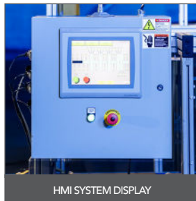
HMI SYSTEM DISPLAY