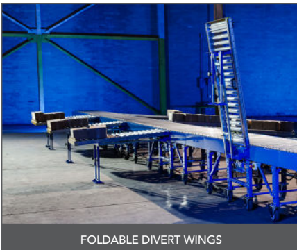
FOLDABLE DIVERT WINGS