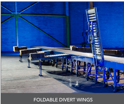
FOLDABLE DIVERT WINGS