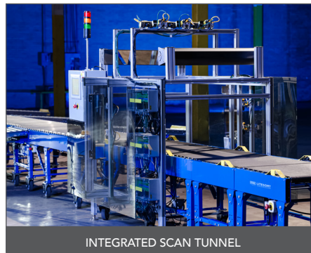
INTEGRATED SCAN TUNNEL