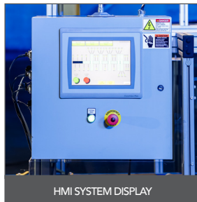
HMI SYSTEM DISPLAY