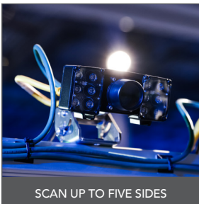
SCAN UP TO FIVE SIDES