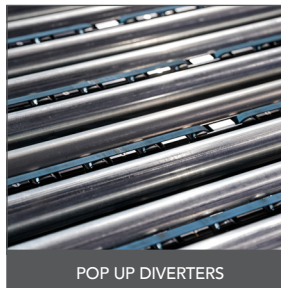
POP UP DIVERTERS