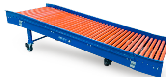
COATED ROLLER INCLINES