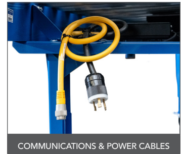
COMMUNICATIONS & POWER CABLES