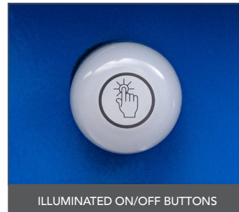
ILLUMINATED ON/OFF BUTTONS