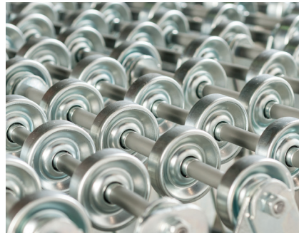
STEEL SKATE WHEELS WITH STEEL BALL BEARINGS