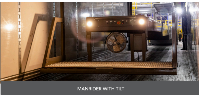
MANRIDER WITH TILT

Technical Support Installation & Service Preventative & Routine Maintenance Application Support Operator & Maintenance Training