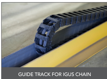
GUIDE TRACK FOR IGUS CHAIN