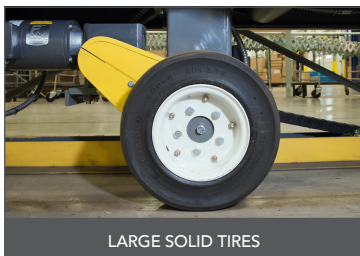
LARGE SOLID TIRES

Technical Support Installation & Service Preventative & Routine Maintenance Application Support Operator & Maintenance Training