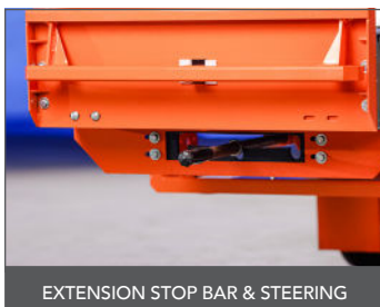
EXTENSION STOP BAR & STEERING

Technical Support Installation & Service Preventative & Routine Maintenance Application Support Operator & Maintenance Training