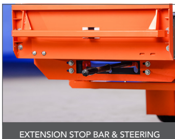
EXTENSION STOP BAR & STEERING

Technical Support Installation & Service Preventative & Routine Maintenance Application Support Operator & Maintenance Training