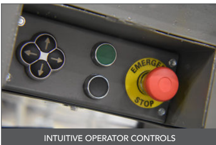
INTUITIVE OPERATOR CONTROLS