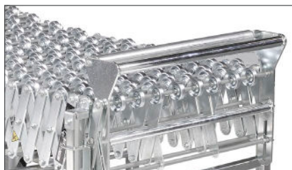
HEAVY DUTY ROLLER PACKAGE STOP