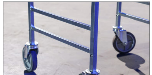
WELDED DOUBLE HORIZONTAL LEG BRACES