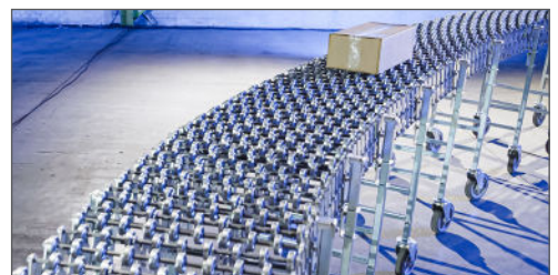
SELF TRACKING DESIGN

VISIT OUR WEBSITE TO LEARN MORE :: WWW.FMHCONVEYORS.COM