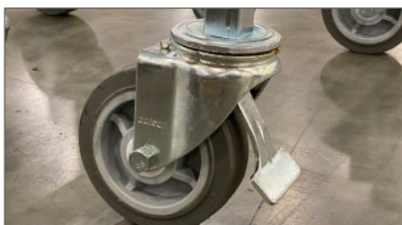
LOCK BRAKE CASTERS ON EACH END