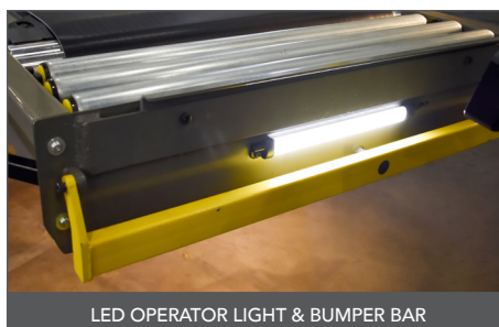
LED OPERATOR LIGHT & BUMPER BAR