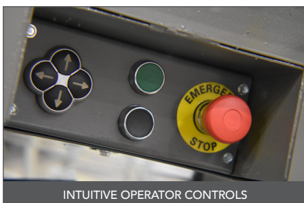
INTUITIVE OPERATOR CONTROLS